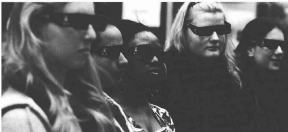
Students viewing a 3D video at the RCSI Open Day